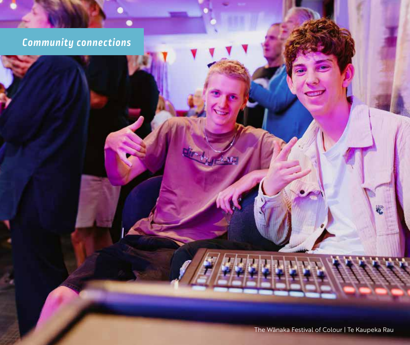
The Wānaka Festival of Colour | Te Kaupeka Rau

We value our community and the important role it plays in helping our students succeed.