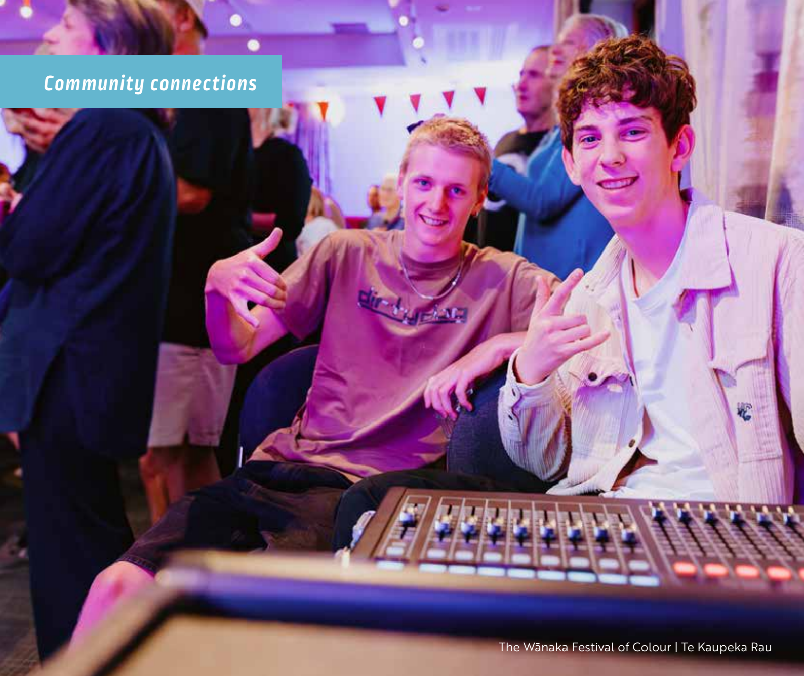
The Wānaka Festival of Colour | Te Kaupeka Rau

We value our community and the important role it plays in helping our students succeed.